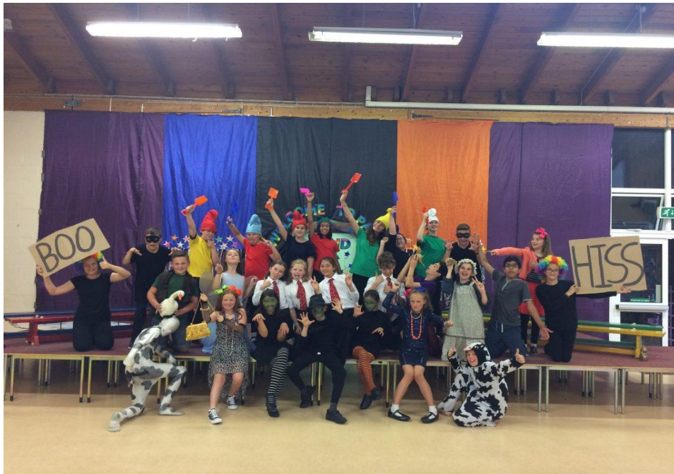
Year 6 production of Panto Pandemonium