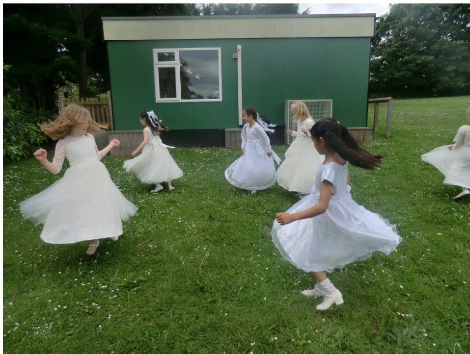
Year 3 girls celebrating First Holy Communion